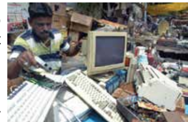
Kabadi wallah dealing in discarded paper, metal, glass and plastic.

Many poor people in the city work as domestic servants as well as work for the corporation at daily wages keeping the city clean. Yet the slums in which they live are quite filthy. This is because these slums seldom have any water and sanitation facilities, proper drainage and regular electricity supply. The reason often given by the Municipal Corporation is that the land in which those poor people have made their homes does not belong to them and they do not pay taxes. However, people living in middle class neighbourhoods pay little in taxes compared to the amount the corporation spends on them for facilities of street lights, regular garbage collection, parks, etc. Also the property taxes collected by the corporation from all the residents of the city including the rich localities makes up only 25-30 per cent