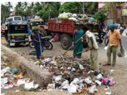
Municipal truck for collecting garbage

The important functions of the Municipal Corporation are water supply, garbage and sewage disposal, sanitation, health, education and housing. Its work also includes to construct and maintain roads, bridges, parks, etc. It also maintains fire-fighting services.