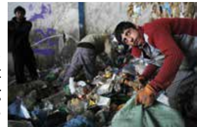
Hazardous way of collecting garbage