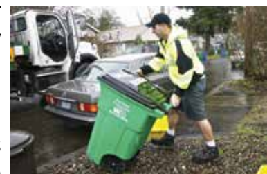
Safe way of disposing garbage