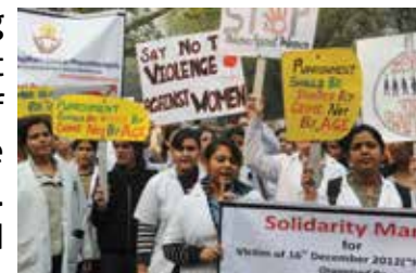
A protest rally by women

Besides voting once in five years, there are other ways of participating regularly in the process of governance. If a country's people are alert and interested in how the country is run, the democratic character of the government will be stable and stronger. It has been seen that the representatives elected by the people overlook the public problems. Then people express their views and make governments understand what actions they should take for public welfare. These include dharnas, rallies, strikes, signature campaigns etc. Things that are unfair and unjust are also brought forward. Newspapers, magazines and television channels also play a role in discussing issues and responsibilities of the government and arousing public awareness about an issue. Then the government tries to explain and defend its decision but finally listens to the people's opinions and takes proper decision and action or change its decision because it is responsible for people.