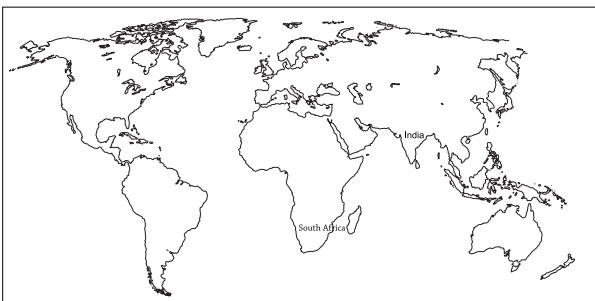
Two democracies related to each other

Blacks and coloured people were not considered to be equal to whites. They were not allowed to vote. Their children in schools were forced to learn the Afrikaans