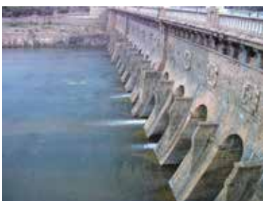
Krishna Sagar dam

We have learnt that differences, prejudices and stereotypes lead to the discrimination. Under the law of a democratic government no discrimination is allowed. But not all sections of the society may be civilised enough. Conflicts occur when people of different cultures, religions, regions or economic backgrounds do not get along with each other, or when some among them feel they are being discriminated against. Sometimes various groups may adopt violent means to settle their differences. This leads to fear and tension among the rest population of a specific area. The government officials resolve these conflicts by getting representatives and influential people of concerned groups to meet and try and arrive at a solution. If a peaceful solution is not reached, police is called to use force and disperse the mob.