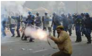
Police using teargas to disperse a violent mob