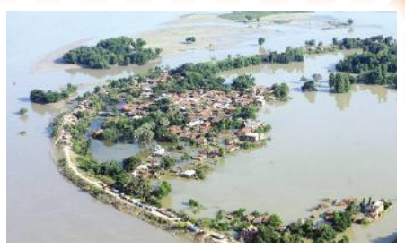
Melting of glaciers