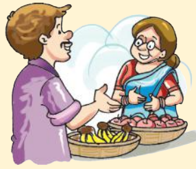
bought — fruits