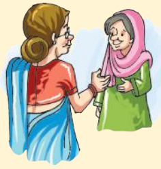
met — friend