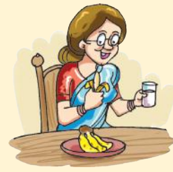
came — drank