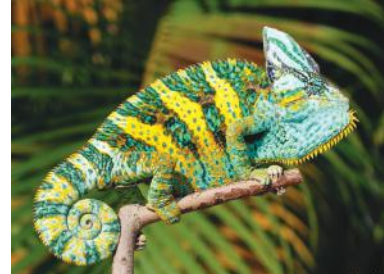
in colour and the frogs found in yellow water are yellow in colour just to dodage. The chameleon can change its colour within a few minutes to escape with east.