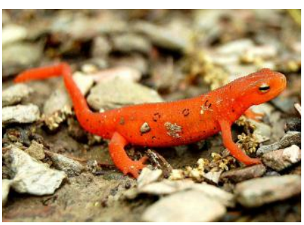
Salamander Tadpole Newts