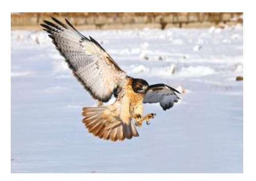
Bat Parrot Hawk