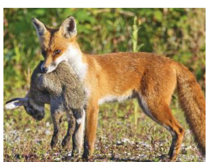
Tiger Lion Fox