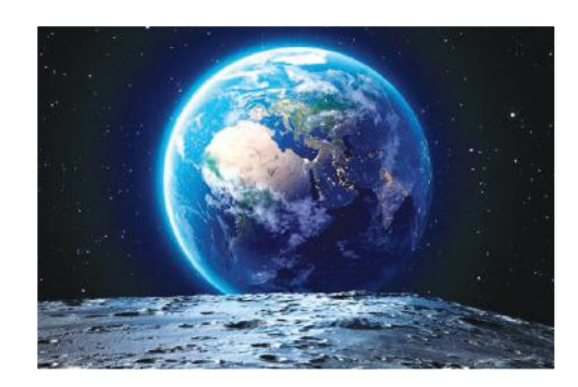
The Earth is round

SHAPE OF THE EARTH The earth is round like an orange. It is slightly flat at the poles and bulging in the middle. Long ago, people thought that the earth is flat. Hundreds of years ago, some the earth is flat. Hundreds of years ago, some european sailors proved that the earth is round. They started from a certain place and went on sailing till they arrived on the place from where they had started. Thus, they proved that the earth is round.