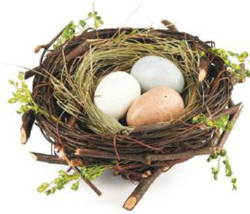
Nest with eggs

The ostrich's egg is the largest egg in the world and the humming bird's egg is the smallest egg.